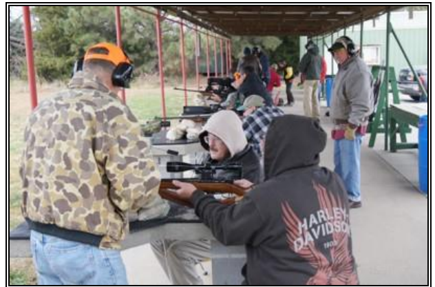
Annual Hunter Sight-in Days

Like many other League chapters, prior to the start of the deer rifle season, they invite the public to “Hunter Sight-in Days” to assist local hunters to prepare for a successful big game hunting season.