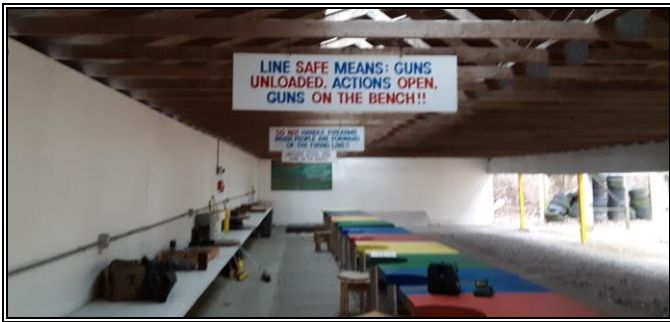
Covered Rifle Range

The chapter also offers a safe covered rifle range with concrete benches for shooting with any conventional rifle caliber at targets at 25, 50, and 100 yards.