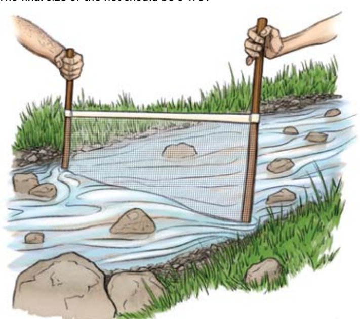
ILLUSTRATIONS BY BOB DRY/WWW.BOBDRY.COM

The final size of the net should be 3' x 3'.