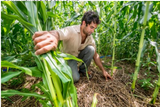
The USDA SARE program funds farmer-driven practical research and education.

The COVID pandemic, war in Ukraine and supply chain disruptions have all highlighted the need for a more resilient food system, but the problem is not new. Decades of consolidation in meatpacking and food