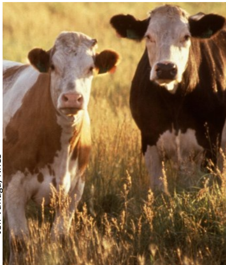
Jeff Vanuga, NRCS

16. Congress should push USDA to do more to promote Continuous CRP signup, and should maintain or increase the goal