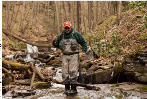
Chesapeake Bay Program

The Regional Conservation Partnership Program (RCPP) was designed to focus federal, state and private dollars to meet the conservation