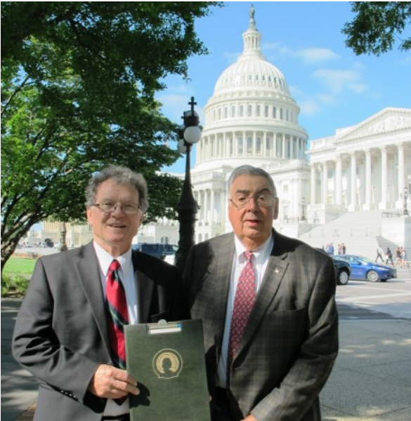
A farmland owner and a farmer, both IWLA members, educate Congress about Conservation Compliance, a pact between taxpayers and farmers that benefits both.

The Farm Bill provides some $20 billion per year for federal crop insurance subsidies, commodity payments, and conservation programs, and billions more in farm loans. Taxpayers expect good value and accountability for their investments in America's farmers and ranchers.