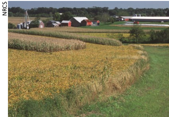
Soil health practices like buffer strips, cover crops and diverse crop rotations are also climate friendly.

Our proposed State & Tribal Soil Health Grant Program takes a similar approach, providing matching funds to help states and tribes craft and implement soil health strategies.