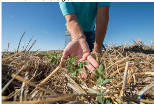
In drought-prone areas soil health practices help conserve moisture.