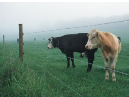
Jeff Vanuga NRCS

The Environmental Quality Incentives Program helps producers put in place structures like fencing and water, irrigation systems, or livestock manure lagoons. It also helps farmers add management practices like planting cover crops, clearing brush, and prescribed grazing plans. Congress directed that USDA spend at