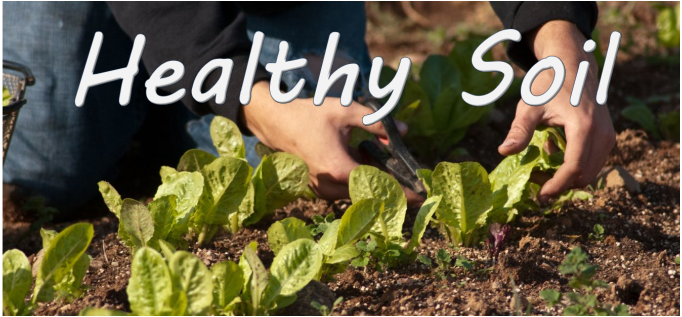
Lance Cheung, USDA