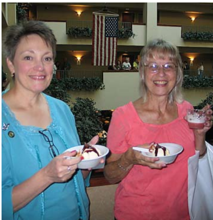
Annual Parade of States: Socialize with fellow Ikes in a casual setting and show us what your state is known for!

floor rooms). If you would like to look at the indoor pool area, visit www.stayholiday.com and click on Recreation and Leisure. Please note: There is a $50 charge for removing furniture from these rooms.