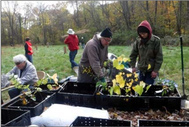
Native tree planting in central Ohio

Chartered in 1922, the Ohio Division of the Izaak Walton League of America was formed to assist, compliment, and support local chapters, providing leadership in conservation and outdoor recreation in Ohio.