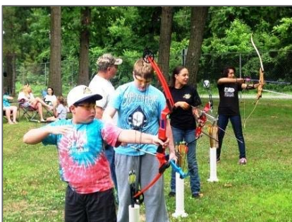
Chapter-sponsored archery clinic

Over the past 95 years, Ohio chapters of the Izaak Walton League have helped thousands of people develop a greater appreciation for Ohio's natural resources and learn ways to help care for Ohio's future through hands-on, grassroots activities.