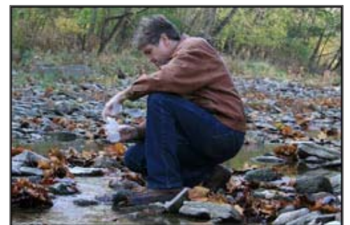
Stream water quality monitoring in the Little Miami River watershed

Today, the Izaak Walton League boasts 24 chapters throughout the state and over 2,000 active members. From Monroe-Huron County to Columbus, Cincinnati, and points east near Akron and west near Toledo, IWLA chapters engage their members and local communities in a wide variety of conservation and outdoor recreation activities aimed at connecting adults and kids with the great outdoors.