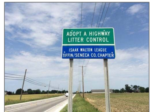
Litter clean-ups on Ohio roadways

The Division also supports local chapters by drawing on a wide base of experts to guide League efforts. Every chapter member in Ohio is a member of the Division. Regular Division meetings are held in the fall and winter.