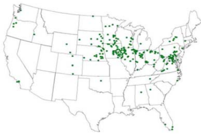
IWLA National Chapters

At the turn of the 20th century, uncontrolled discharges of industrial waste and raw sewage, unrestricted logging, and soil erosion threatened to destroy the nation's most productive waterways. The country's forests, wetlands, and wilderness areas were quickly disappearing. In 1922, 54 sportsmen declared that it was "time to call a halt" to this destruction. Aware that action – not just talk – would be necessary to solve these problems, the group decided to form an organization to combat water pollution and protect the country's woods and wildlife. As a reminder of their purpose, they named the organization after Izaak Walton, the 17th-century angler-conservationist who wrote the literary classic, The Compleat Angler .