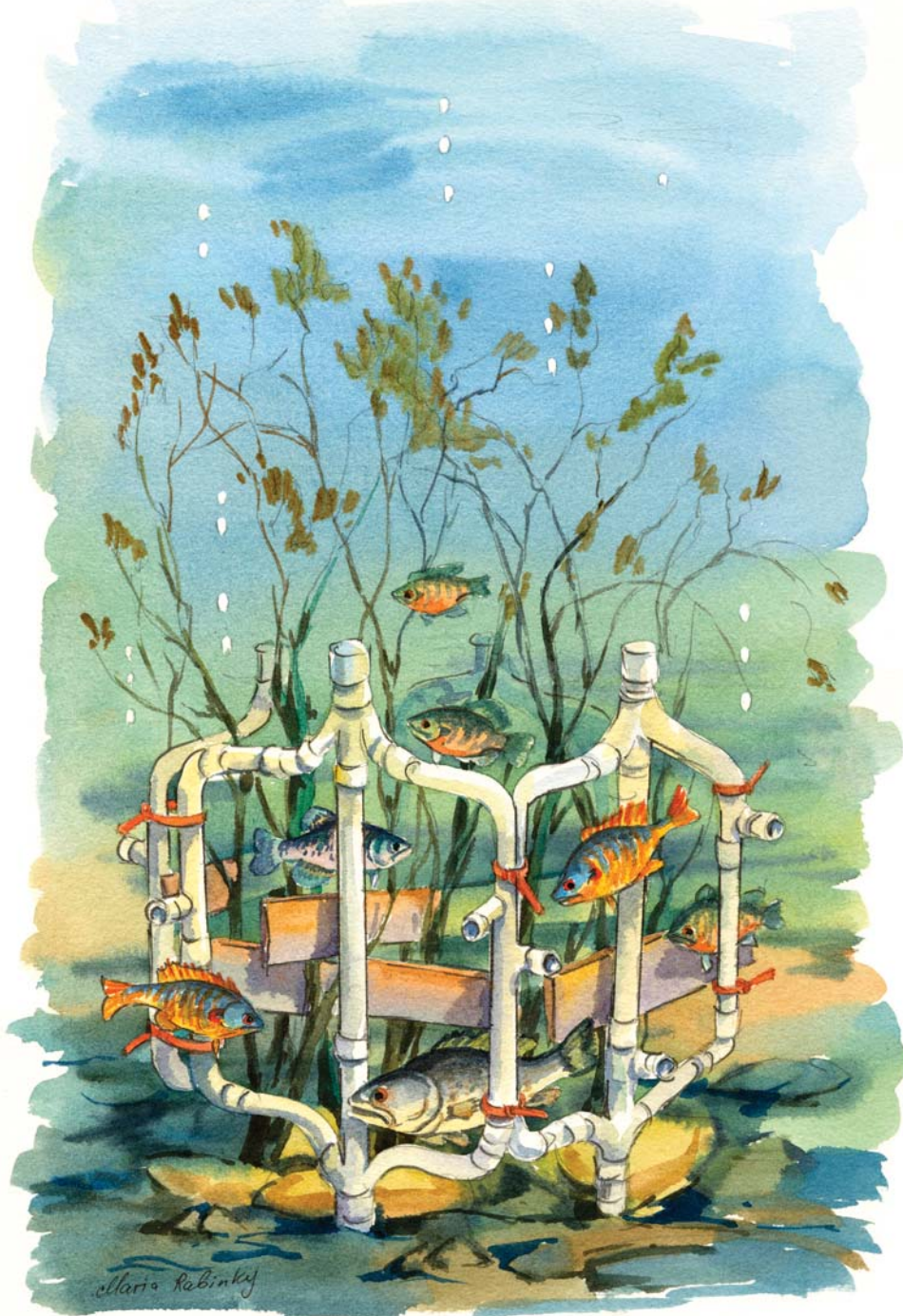
ILLUSTRATIONS BY MARIA RABINKY

Before starting this project, find out if there are similar plumbers’ exams in your state in order to obtain discarded pipes. If not, any discarded plastic materials that can create a solid structure could be used, so be creative.